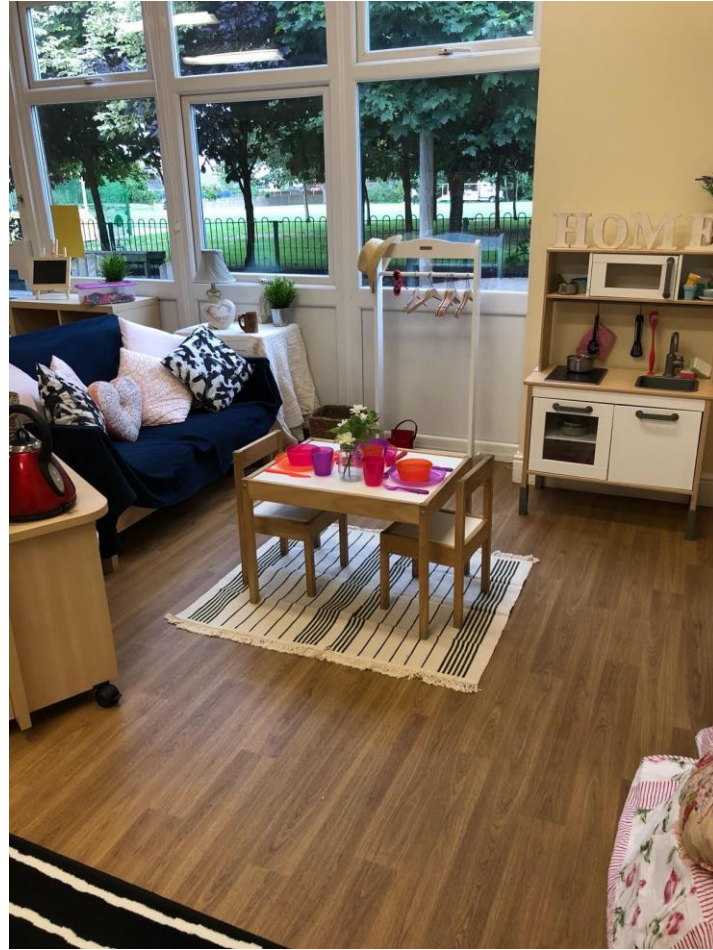
Home corner/ role play