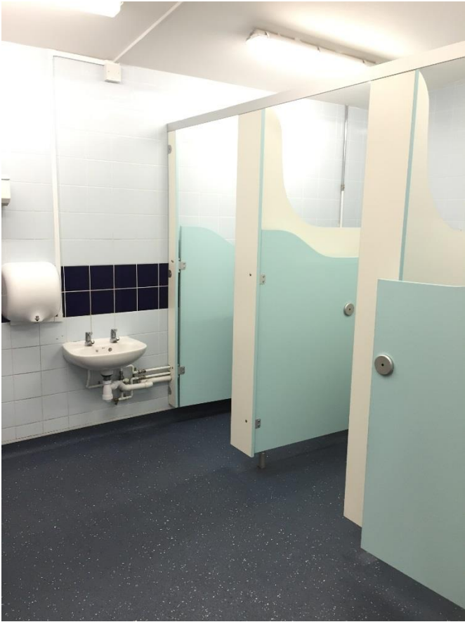
Toilets- within classroom