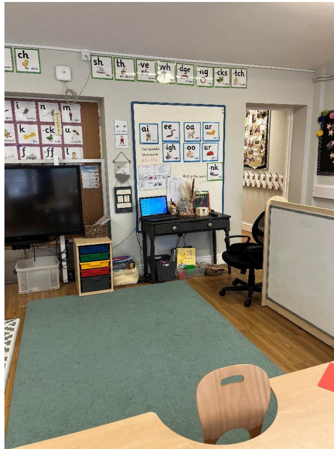
Carpet area for circle time/lessons