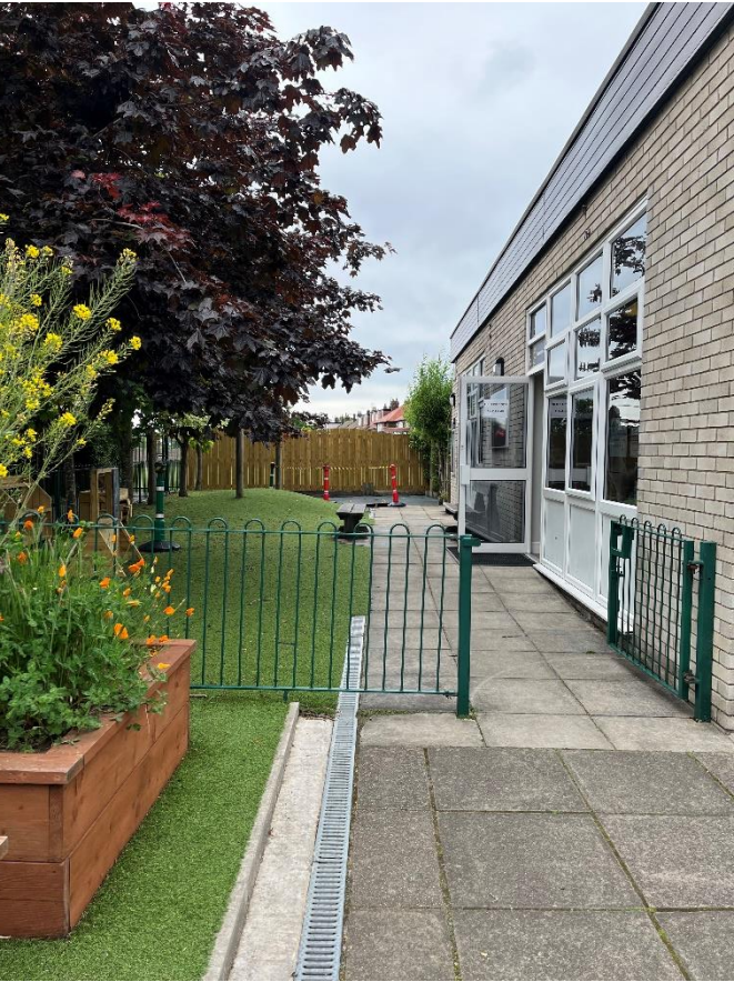
Reception entrance and outdoor area