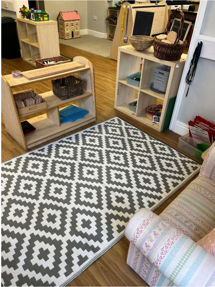
Funky fingers-Lego,threading, pegs