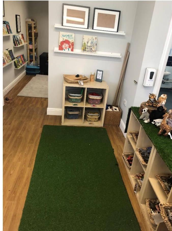
Construction-Duplo, blocks, animals, people, vehicles