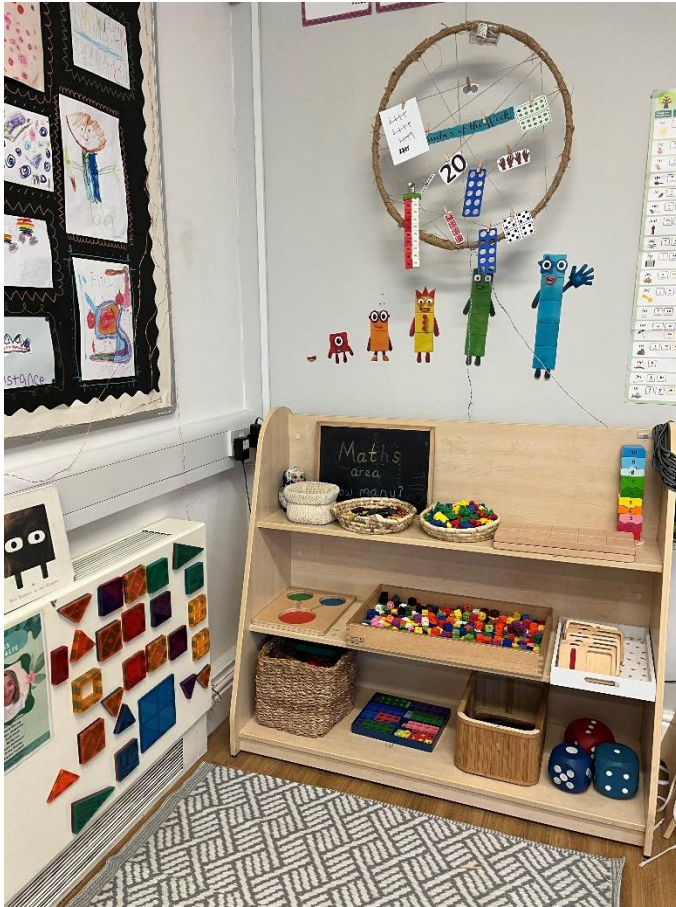
Maths- counters, dice, cubes, magnetic tiles